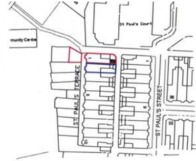
Location Plan Scale: 1/1250

10/1628/COU STOCKTON BOROUGH COUNCIL DEPOSITED PLAN 10 AUG 2010 SUPERSEDES PLAN DATED 22nd June 2010 HEAD OF PLANNING & ENV.